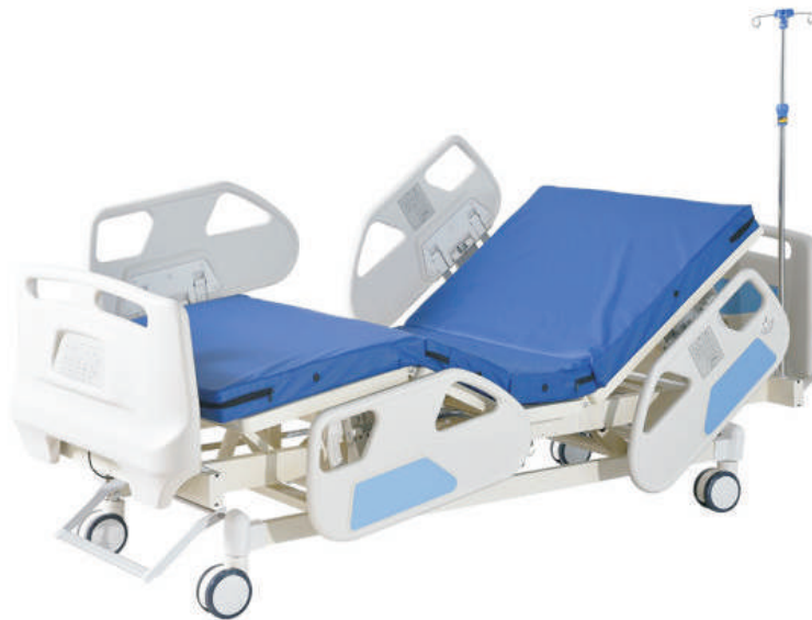
MOTORIZED 7 FUNCTION ICU BEDS (VEH-001)