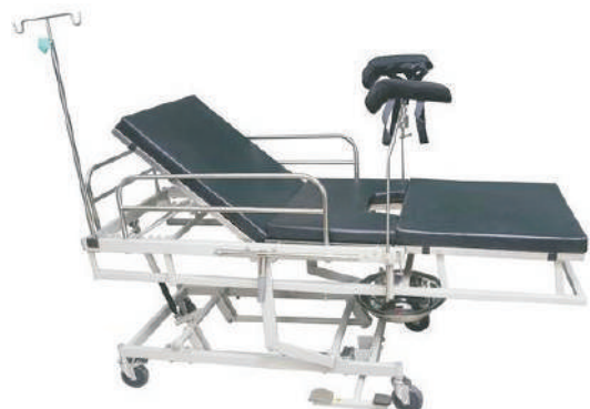
OBSTETRIC LABOUR TABLE TELESCOPIC-HYDRAULIC (VEH-151)