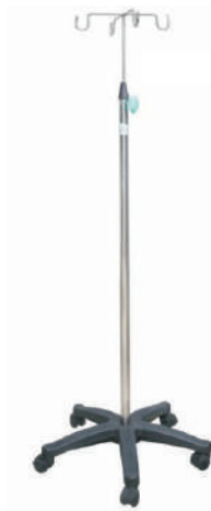
SS-HOSPITAL 4 HOOKS IV STAND (VEH-132)