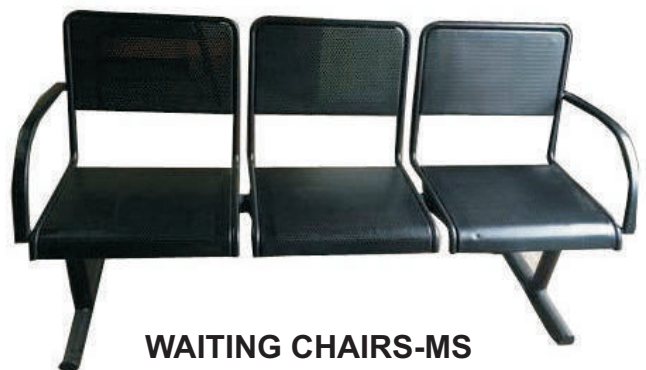
WAITING CHAIRS-MS (VEH-191)