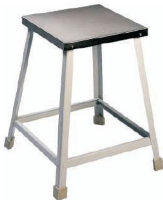
VISITOR STOOL VEH-110