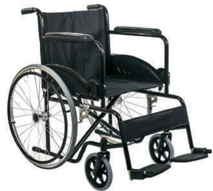
FOLDABLE HANDICAP WHEEL CHAIR (VEH-100)