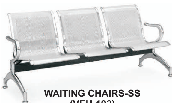
WAITING CHAIRS-SS (VEH-192)