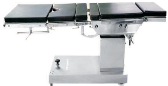
HYDRAULIC OT TABLE (VEH-163)