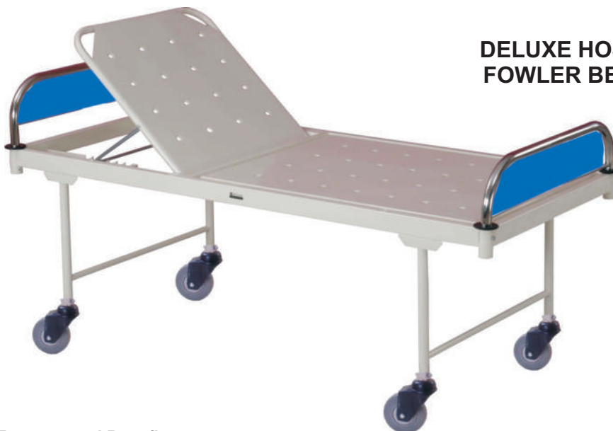
DELUXE HOSPITAL SEMI FOWLER BED (VEH-032)