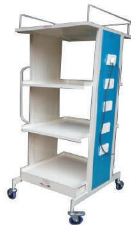
MONITOR TROLLEY (VEH-81)