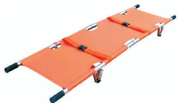
FOLDABLE STRETCHER (VEH-91)