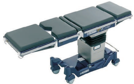
SUPREME SLIDING TOP ELECTRIC OT TABLEVEH-161