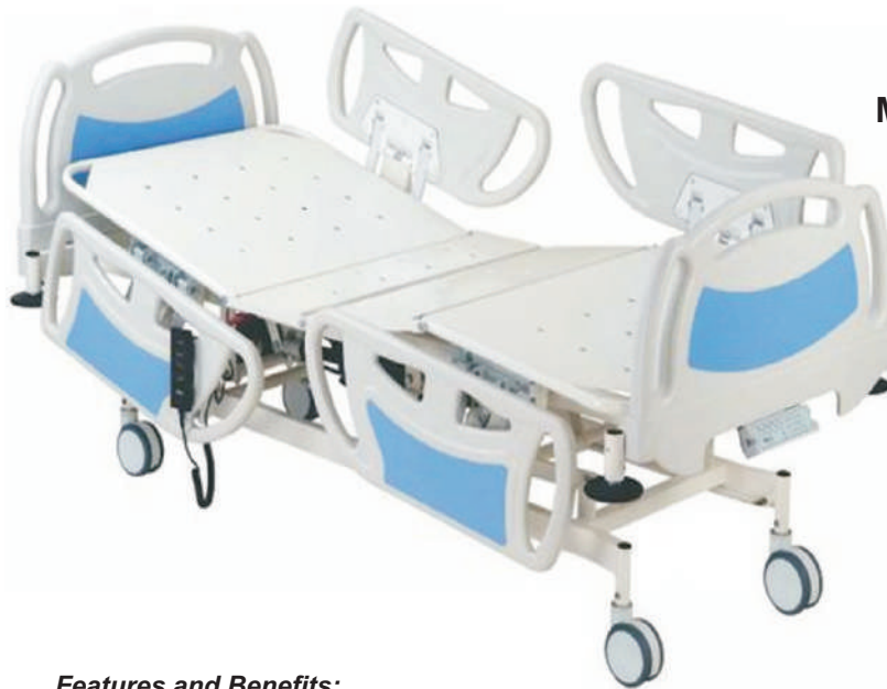
MOTORIZED 3 FUNCTION ICU BED (VEH-003)