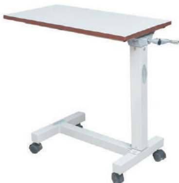
SUPREME OVER BED TABLE (VEH-121)