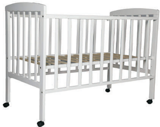
BABY COT (VEH-182)