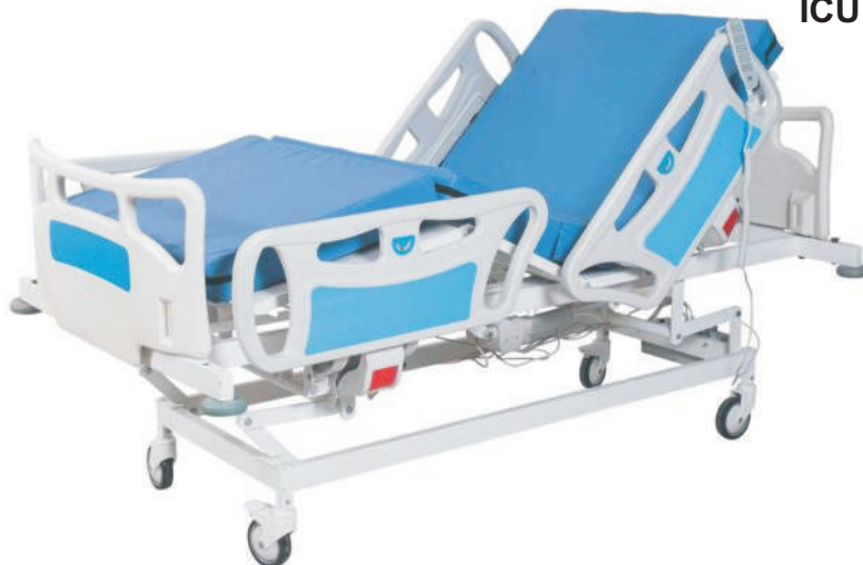
MOTORIZED 5 FUNCTION STANDARD ICU BEDS (VEH-002)