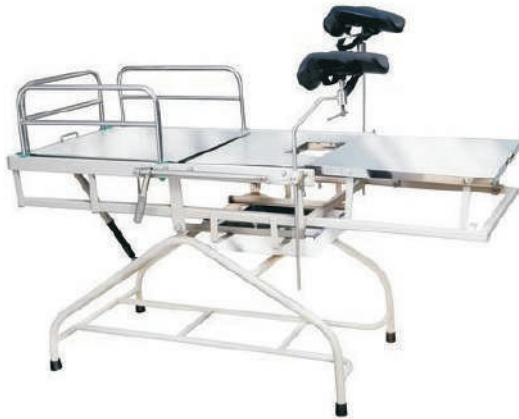
OBSTETRIC LABOUR TABLE TELESCOPIC(SS)VEH-152