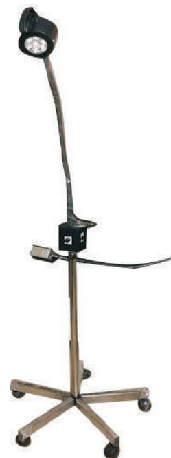
EXAMINATION LIGHT HALOGEN (VEH-254)