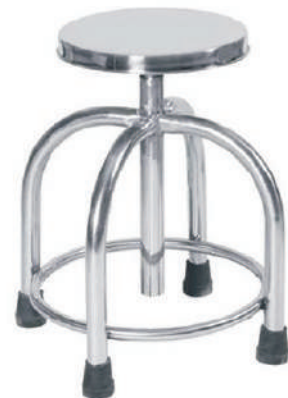
PATIENT REVOLVING STOOL (VEH-111)