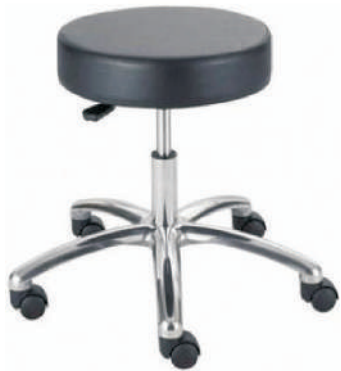
SURGEON STOOL (VEH-112)