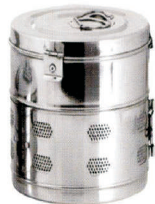
DRESSING DRUM (VEH-241)