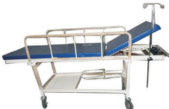
TROLLEY WITH REMOVABLE/ FIXED STRETCHER (VEH-94)