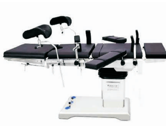
C-ARM COMPATIBLE ELECTRIC OT TABLE (VEH-162)