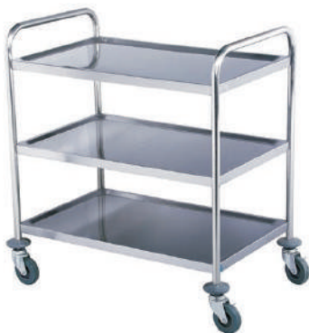
HI-TECH STAINLESS STEEL FOOD SERVING TROLLEY (VEH-85)