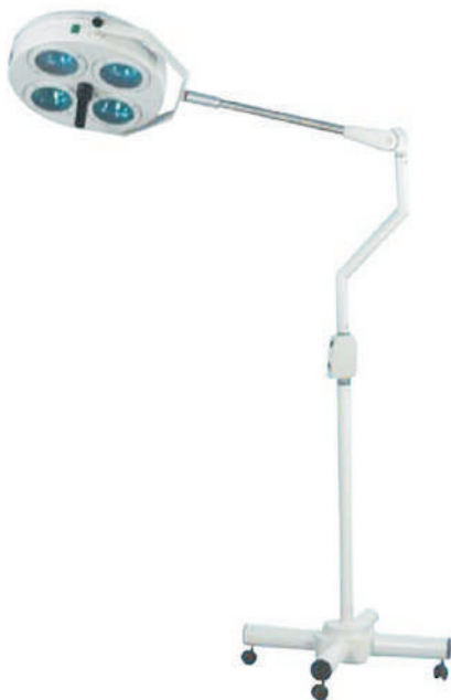
MOBILE HELOGEN LIGHT (VEH-253)