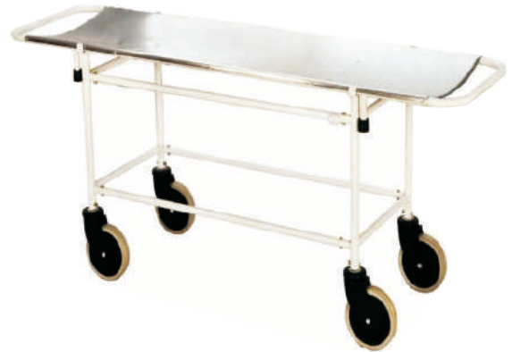
STRETCHER TROLLEY (MS) (VEH-93)