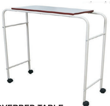
FIXED OVERBED TABLE (VEH-123)