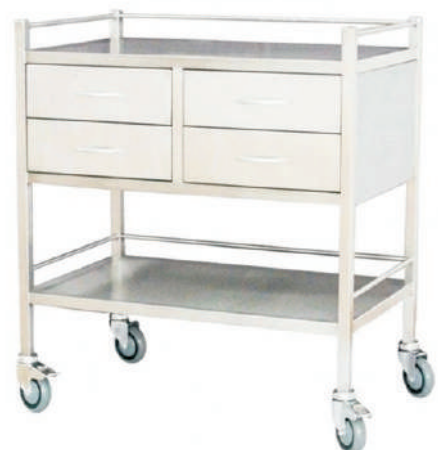
DRAWER MEDICINE TROLLEY(MS) (VEH-067)