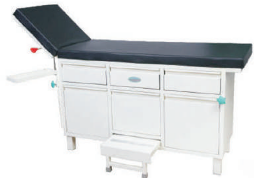
STANDARD EXAMINATION COUCH WITH CABINET VEH-142