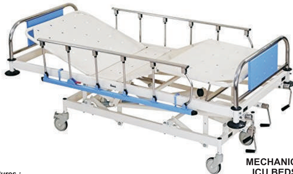
MECHANICAL DELUXE ICU BEDS (VEH-011)