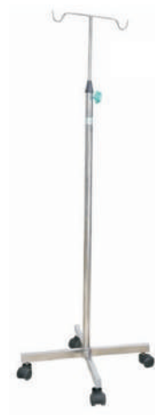
SS-HOSPITAL 2 HOOKS IV STAND (VEH-133)