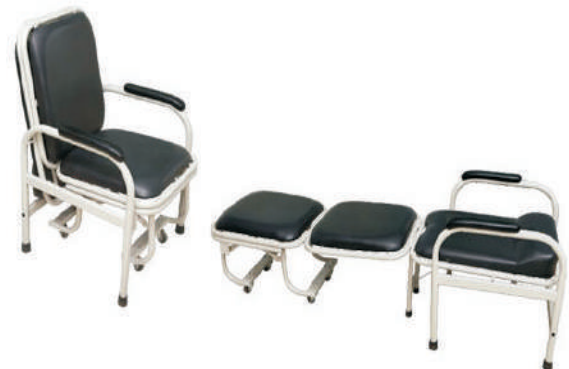
HOSPITAL ATTENDANT BED CUM CHAIR (VEH-172)