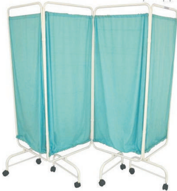
FOLDING DRESSING SCREEN (VEH-211)