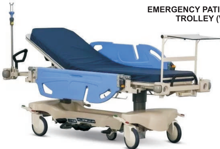
EMERGENCY PATIENT TRANSFER TROLLEY (VEH-065)