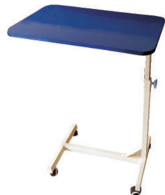
DELUXE OVERBED TABLE (VEH-122)