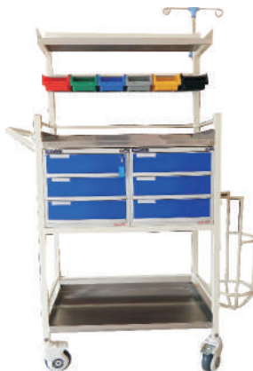
CRASH CART TROLLEY (VEH-070)