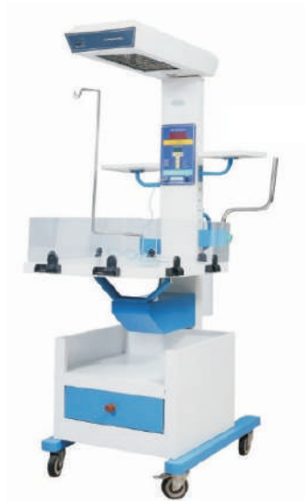
INFANT WARMER (VEH-181)