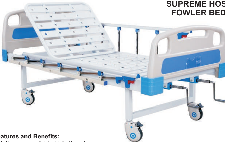
SUPREME HOSPITAL SEMI FOWLER BED (VEH-031)