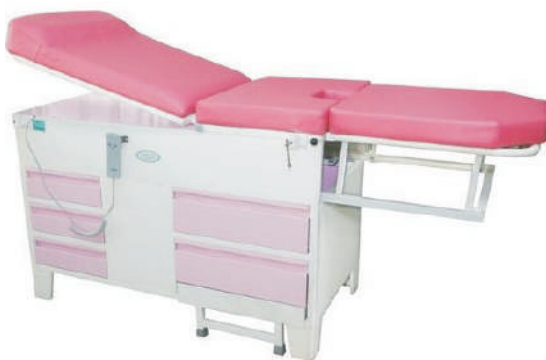
DELUXE EXAMINATION COUCH (VEH-143)