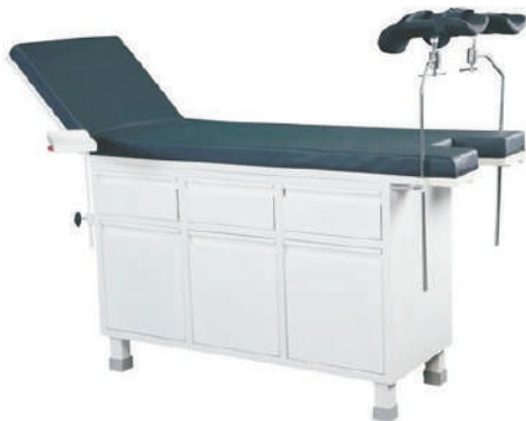
GYNAE EXAMINATION COUCH (VEH-141)