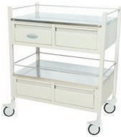
DRAWER MEDICINE TROLLEY(SS) (VEH-066)