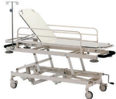
PATIENT EMERGENCY RECOVERY TROLLEY (VEH-069)