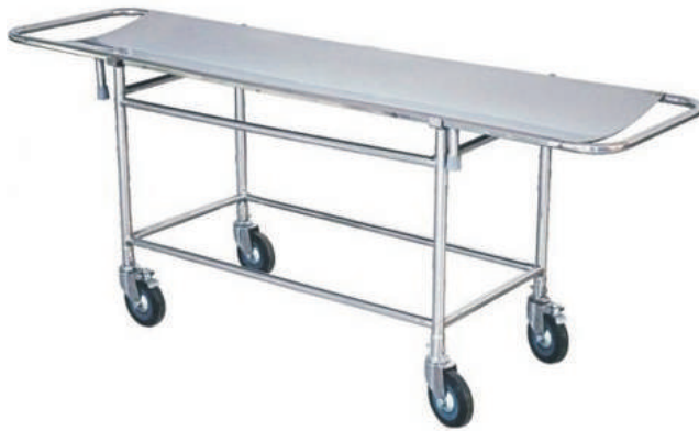
STRETCHER TROLLEY (SS) (VEH-92)