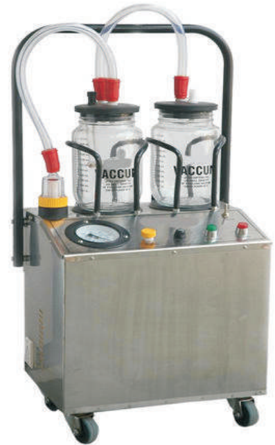
SUCTION MACHINE (VEH-221)