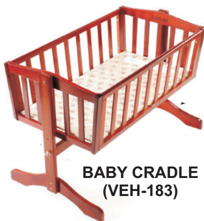
BABY CRADLE (VEH-183)