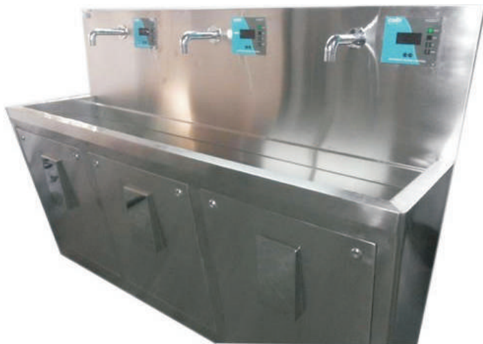
HI-TECH STAINLESS STEEL SCRUB STATION (VEH-231)