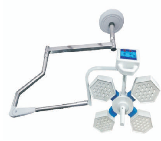
LED OT LIGHT TWIN (VEH-251)