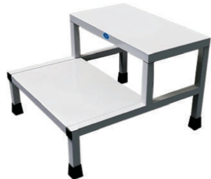
SINGLE & DOUBLE STEP FOOT STOOL (VEH-113)