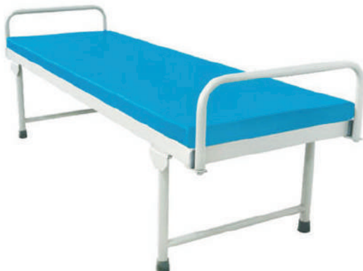
HOSPITAL ATTENDANT BEDS (VEH-171)