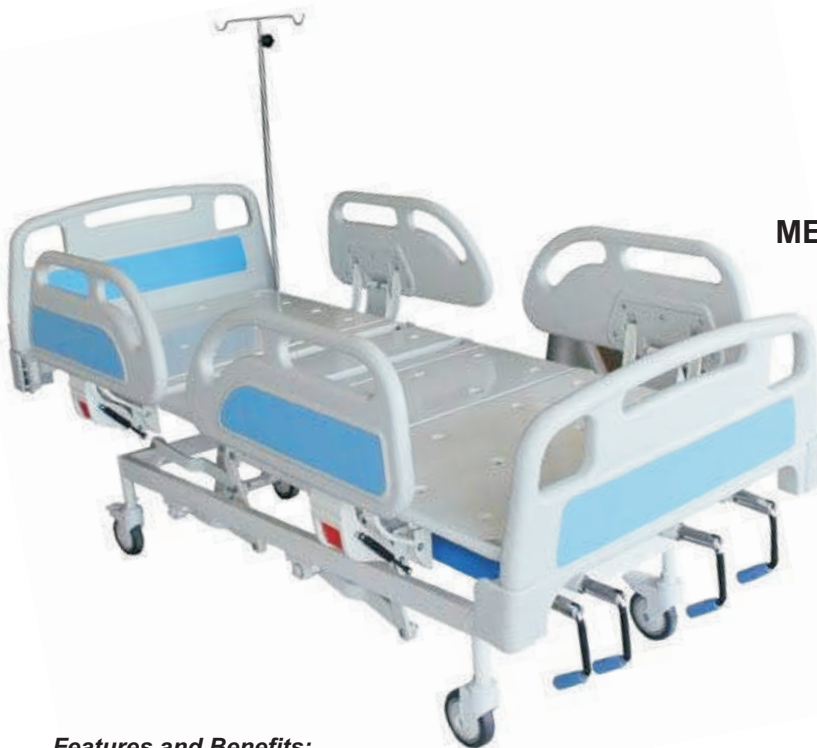
MECHANICAL SUPREME PLUS ICU BEDS (VEH-012)