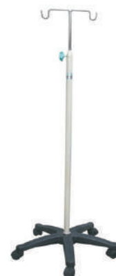
MS-HOSPITAL IV STAND (VEH-131)