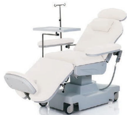
MOTORIZED DIALYSIS CHAIRS (VEH-201)