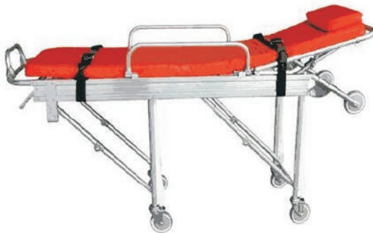
AMBULANCE PATIENT TROLLEY (VEH-068)